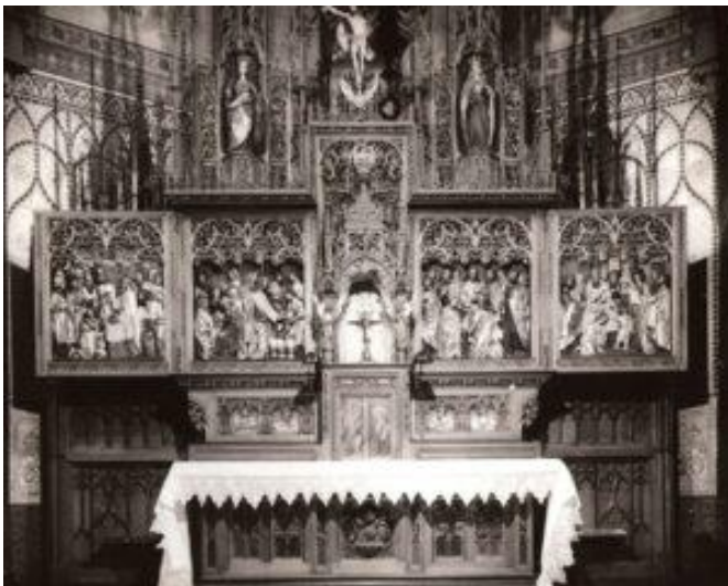
Photo two is one of the few photos that exists of the main altar in the original St. Joseph's Church. The magnificent altar was hand carved by Bavarian craftsmen.

St. Joseph Church (photo from 1894) was built in 1882 to replace the earlier wooden church in the background (built in the 1860's and demolished in 1906 to make way for the Rectory).