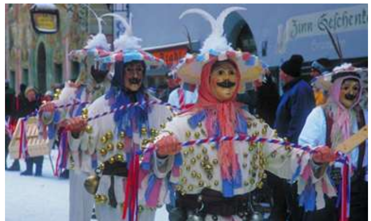
Die Gröllratscher springen mit Schellenklang begleitet von Rätschen schwingenden Maschkerä durch Mittenwald.