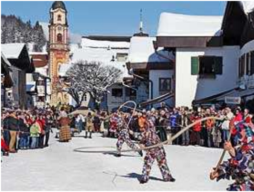
"Goalschnalzer" (whip performers), "Bärentreiber"

white underpants, kerchiefs and sheeps' wool jackets. They use a stretched blanket to launch a straw puppet or rag doll (the Jackl), symbolizing winter, high into the air.