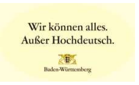
Ad by German State of Baden-Württemberg saying: "We can do everything, except speak standard German"

Germans get swept off their feet when they hear the dialect spoken in Bavaria. Almost every fourth German has their heart skip a beat when listening to the softer-sounding variety of German, but they cringe when the Saxonian or Rhineland Palatinate dialect is within earshot.