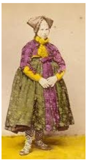
Pomerania Hessian Schliffenberg Freiburg Dachau Bavaria Come to the meeting on Wednesday and learn more about the German Trachten.