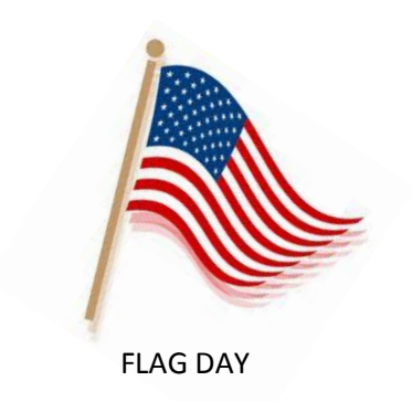
Meeting: June 14th