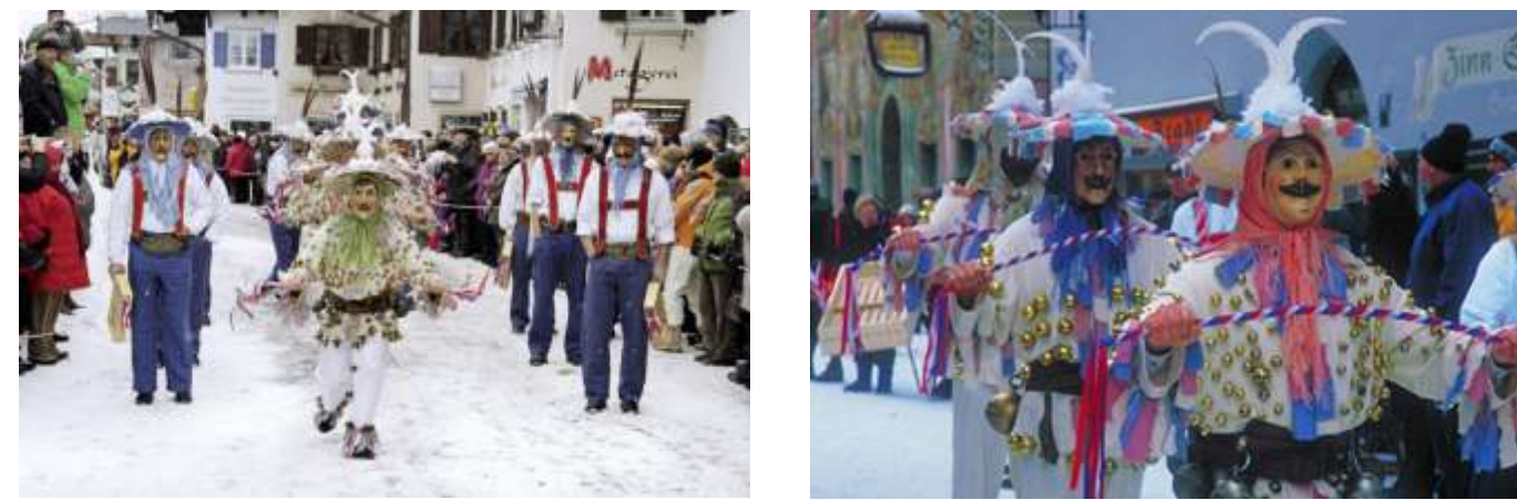
Die Gröllratscher springen mit Schellenklang begleitet von Rätschen schwingenden Maschkera durch Mittenwald.

The costumes worn by the wild men and women are carefully created by hand: Around 6,000 dark red felt diamonds are sewn onto rough hessian, then gold braid and small bells are added, along with hand-knotted green woolen lace. The masks are carved and designed by a local artist. The Altmühltal natural reserve is renowned for its Fasching carnival traditions. The customs have been traced back to the 18th century.