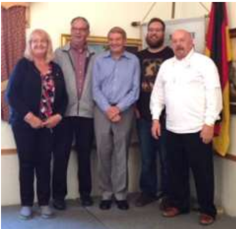
Your National Executive Board – 2017-2019